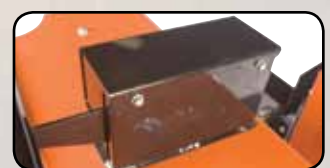
Four-position control box features two "reverse" positions