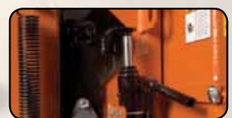
Hydraulic jack easily raises and lowers the feed roller for easy in-field servicing