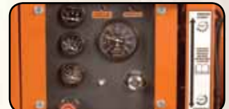
Full gauge panel and hand-operated belt engagement lever assure ease of use