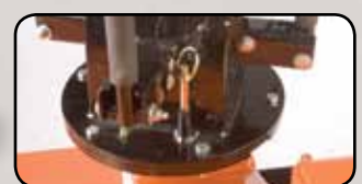
Locking pin keeps discharge chute in safe, operable position