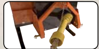
Easy three point hitch hooks directly to the tractor for on demand power