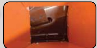
Large 9"x9" feed opening quickly accepts branches