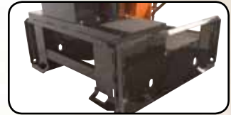
Two mounts for either front- or curb-side feeding