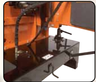
Hydraulic jack makes feed roller maintenance easy and speed lever controls feed rate