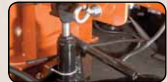
Hydraulic jack easily raises and lowers the feed roller