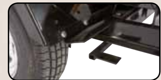
Convenient foot pedal easily engages belts