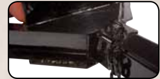
"C"-channel frame construction for extra strength